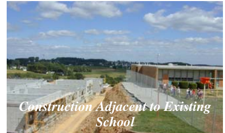
Construction Adjacent to Existing School