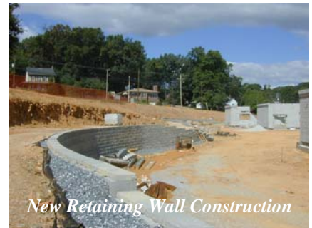
New Retaining Wall Construction